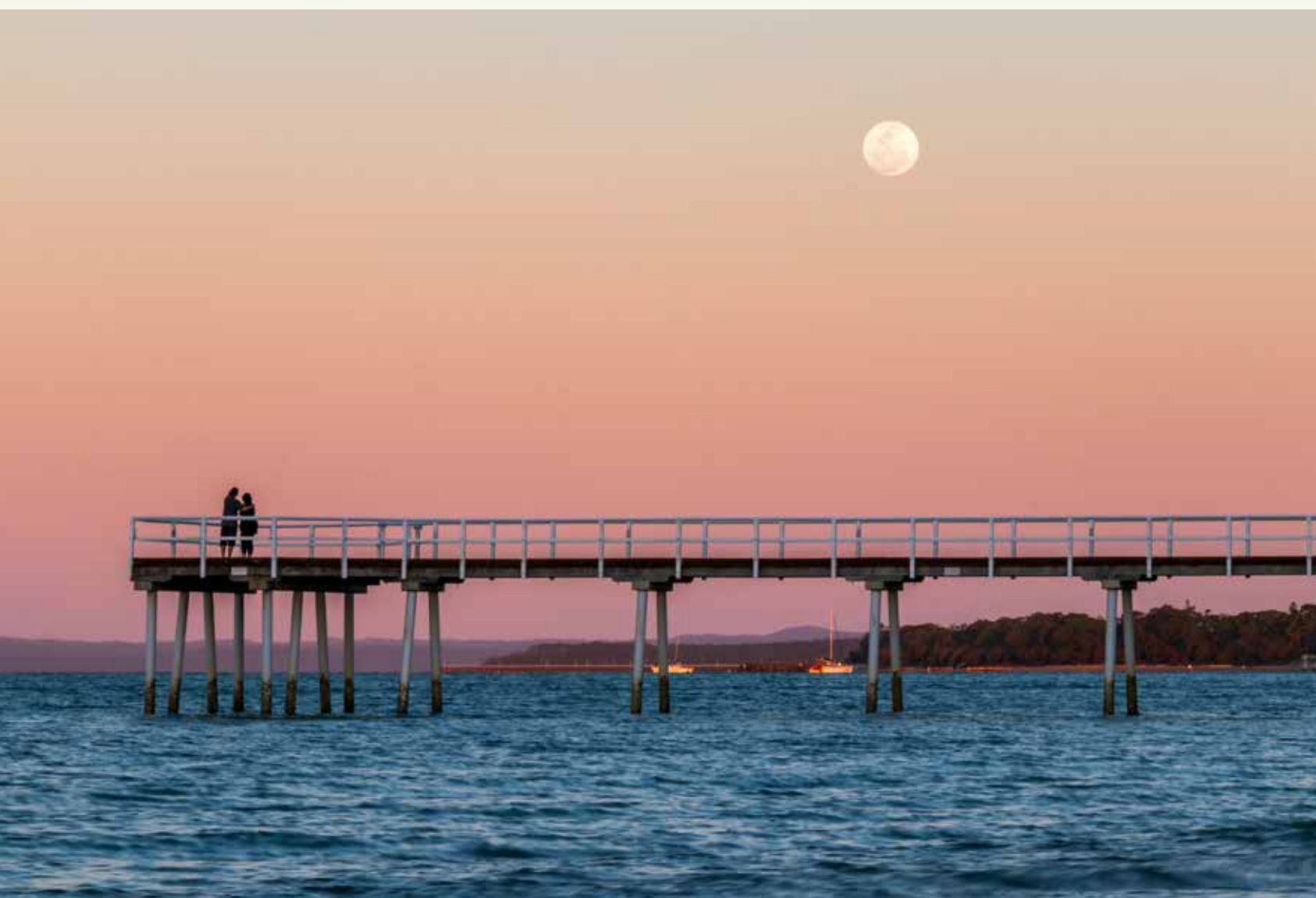
Cover: Dundowran Beach, Hervey Bay