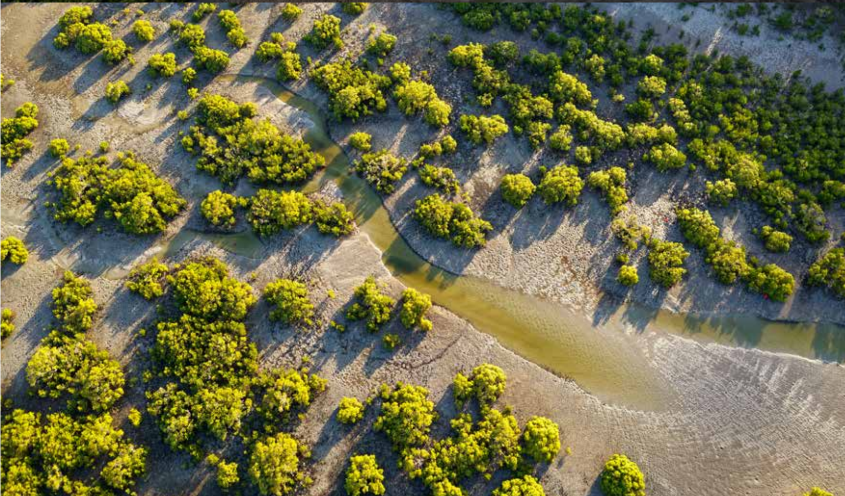
Great Sandy Strait - K'gari