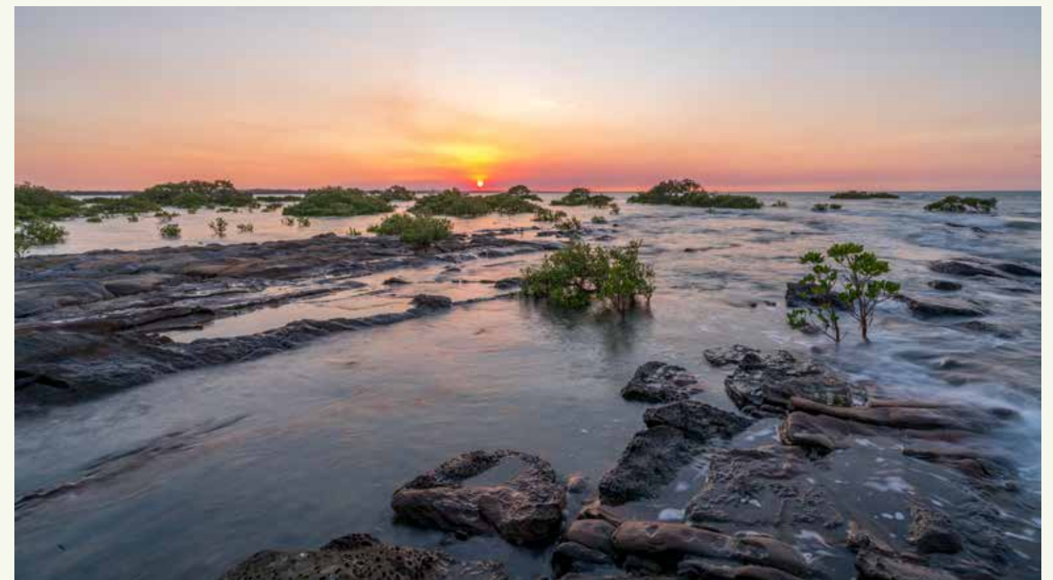
Gatakers Bay, Point Vernon

With an impressive range of schools, amenities, shops, dining options, as well as hospitals and an airport, Hervey Bay has everything you need in all stages of life. Just 10 minutes west of the bustling town centre lies the beach front suburb of Dundowran Beach, where your new home base awaits.