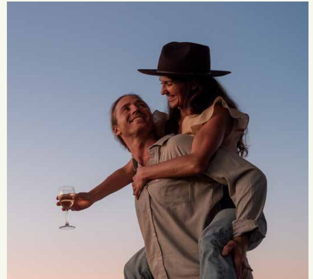
Torquay Pier, Hervey Bay